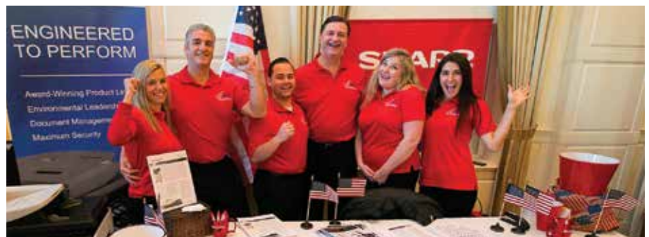
Company reps from American Document Solutions.

The 2016 EXPO date is Monday, October 24. Doors open to the general public at 4:00 pm and close at 8:00 pm. Free shuttles from the parking lots run continuously through the evening. More information about EXPO, including exhibitor contracts, is available at www.sussexcountychamber.org . ■